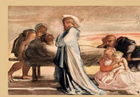
Jesus' Great Compassion

VOCATION VIEWS Jesus is compassionate especially with those who mourn. Are you able to touch the lives of those who grieve? Could God be calling you to serve others through Church ministry? (Luke 7:11-17)